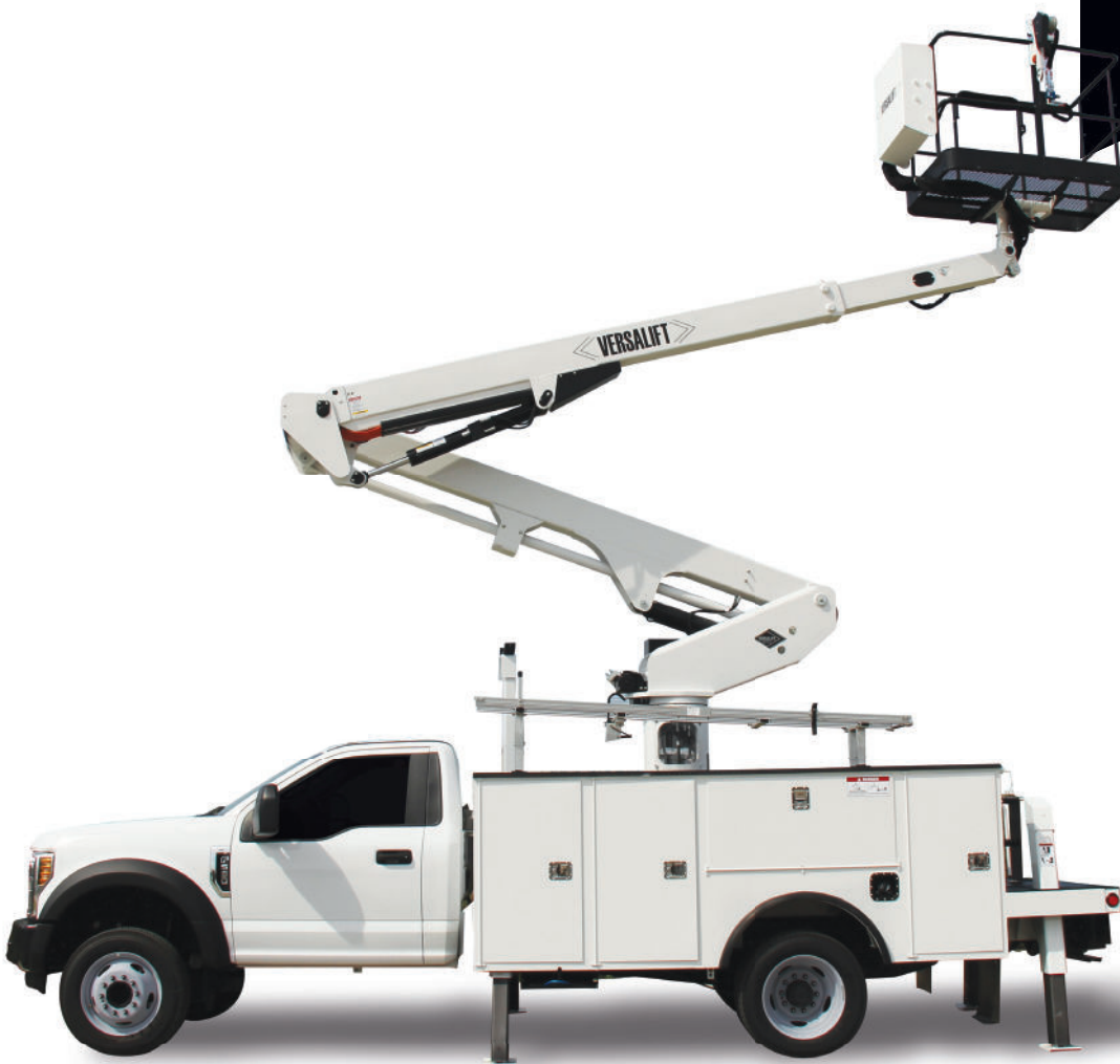
VST-50-TN model shown here.

LARGE TOP-MOUNTED STEEL PLATFORM 36 IN X 60 IN X 43 IN