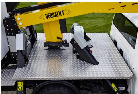
Clear deck with space for cabinets