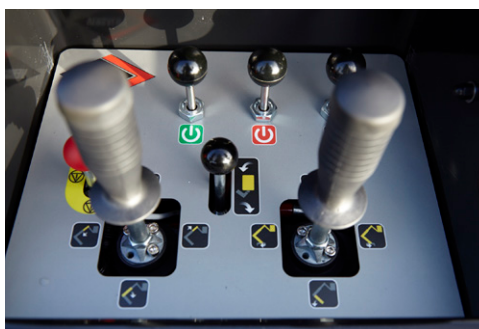
Full hydraulic controls