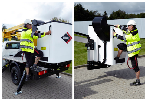
Bucket entry from the vehicle & from the ground