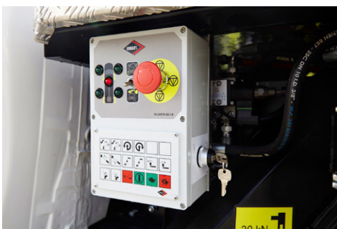
Electro-hydraulic lower controls