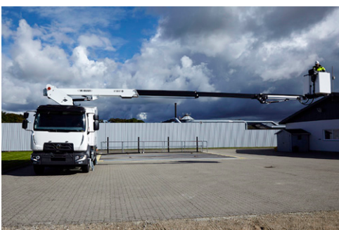
Turret/knuckle tail swing and outriggers within the mirrors