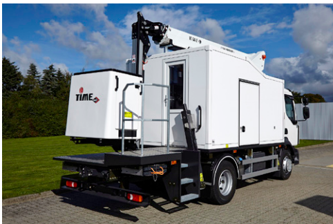
Workshop module for the chassis (optional)