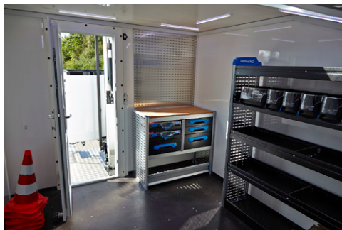
Workshop interior (optional)