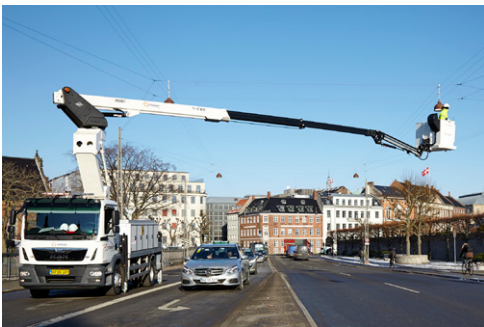
Reach worksites "up and over" obstacles