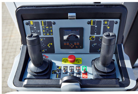
FPC (Full Proportional CANbus controls): Variable outreach (with load cell) and up to 4 actions at a time