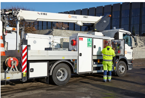
Cabinets for the chassis (optional)