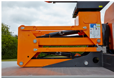
Hydraulic lift elevator (3 m)