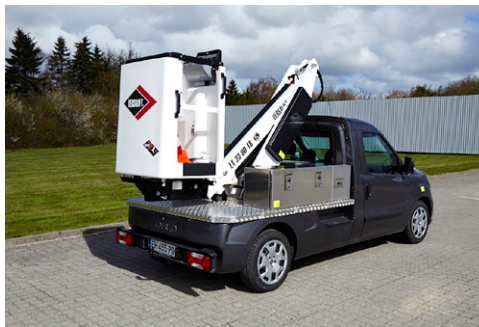
1 man "Eco" fibreglass bucket