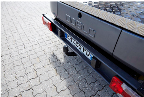
Tow bar (optional)