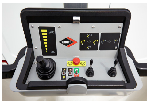
RLC (Relay Lefthand proportional Controls): Fixed outreach and 1 action at a time