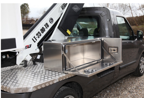
Aluminium cabinets for the chassis (optional)