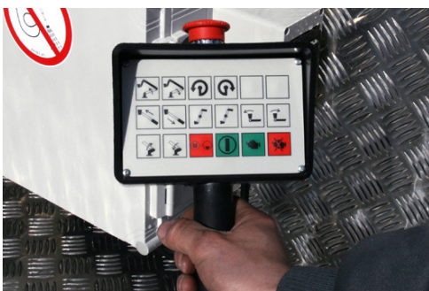
Lower control panel (wired remote control panel)