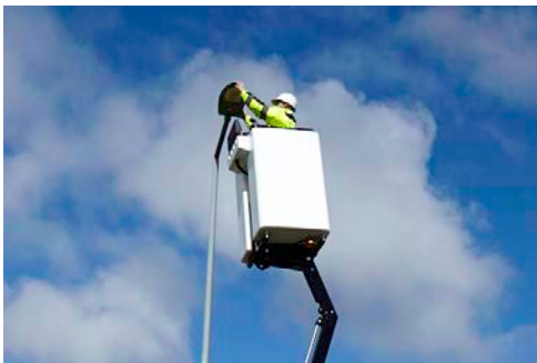
1 man "Eco" fibreglass bucket