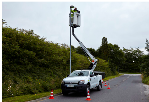
No outriggers required for stability