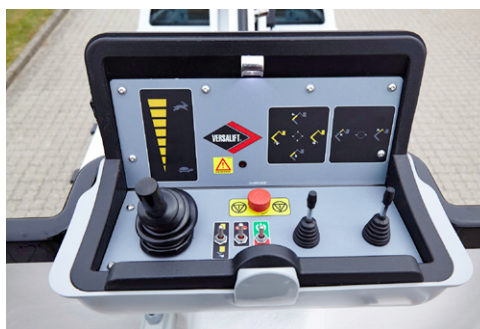
RLC (Relay Lefthand proportional Controls): Fixed outreach and 1 action at a time