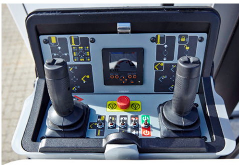
FPC (Full Proportional CANbus controls): Variable outreach (with load cell) and up to 4 actions at a time