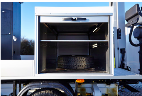
Cabinet for the chassis (optional)

Ground level emergency lowering from the chassis (pedestal mounted valve bank)