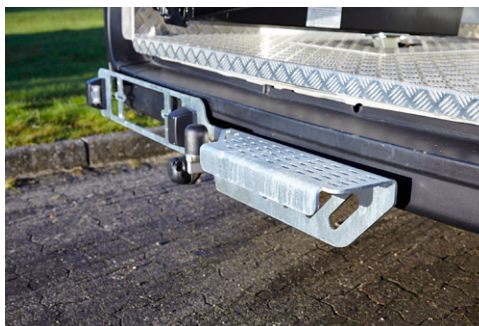
Licence plate frame with step for easy bucket entry