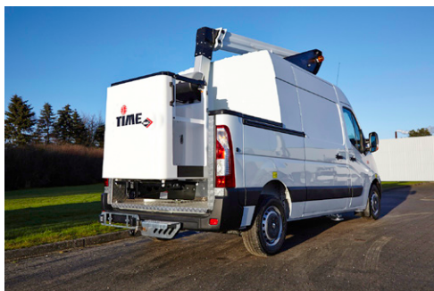
The bucket is stowed in the cutaway section of the van for compact transport dimensions