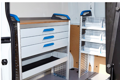
Workshop interior (optional)