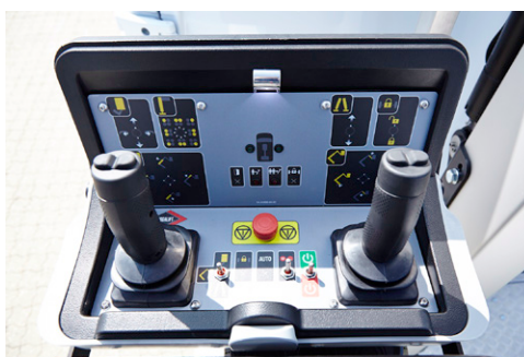
LMC (Load Moment Controls): Variable outreach and up to 2 actions at a time (1 per joystick)