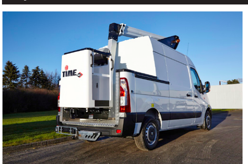
The bucket is stowed in the cutaway section of the van for compact transport dimensions