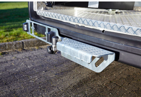
Licence plate frame with step for easy bucket entry