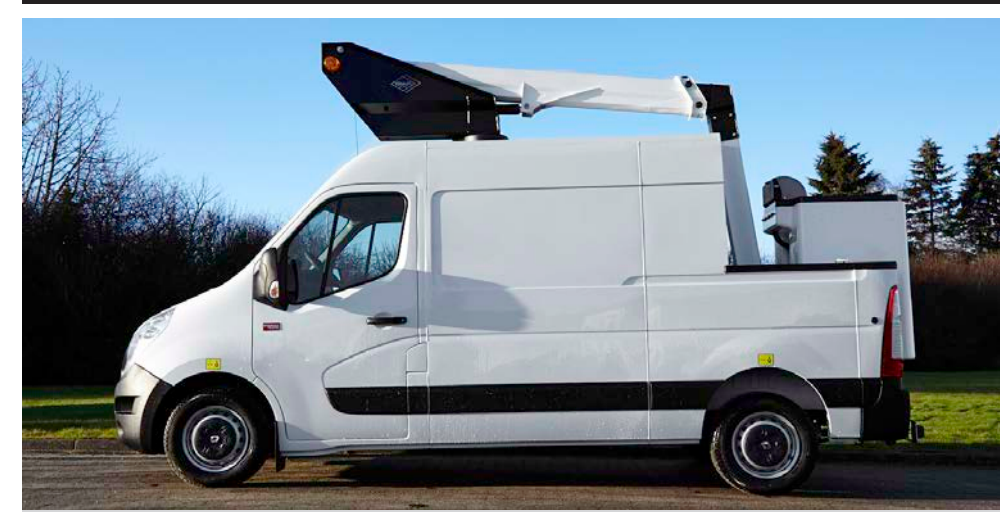
Length: 5,612 mm