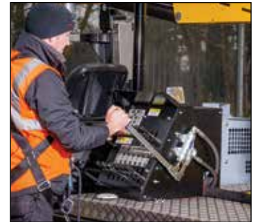
Hydraulic and 12V DC emergency ground controls with hand pump for improved safety