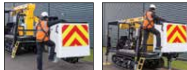
Safe access to bucket from ground or Morooka chassis