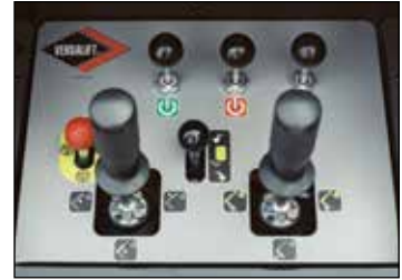
Easy to use fully hydraulic proportional control