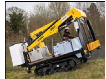
High 'Ride on' tracking speed of 5.6mph/9.0kph