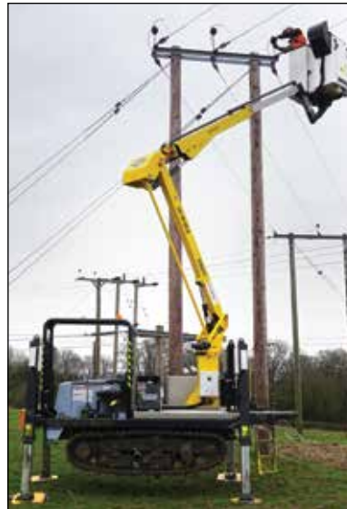
Platform mounted on a Morooka MST300VD