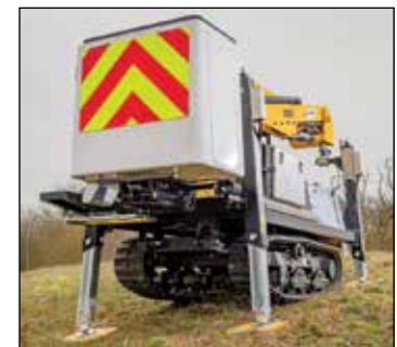
Capable of levelling on slopes up to 10°

The photographs in this brochure are for promotional purposes only. Specifications are subject to change without notice.