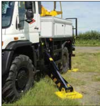
Improved stability with proven A-frame and radial outrigger system