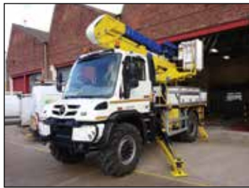
Mounted on a Mercedes Unimog U423 Euro 6

The photographs in this brochure are for promotional purposes only. Specifications are subject to change without notice.