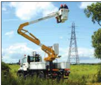
Can work on live network up to 46kV CAT C