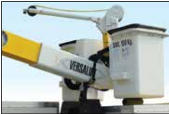
Jib and winch provides up to 670kg lifting capability