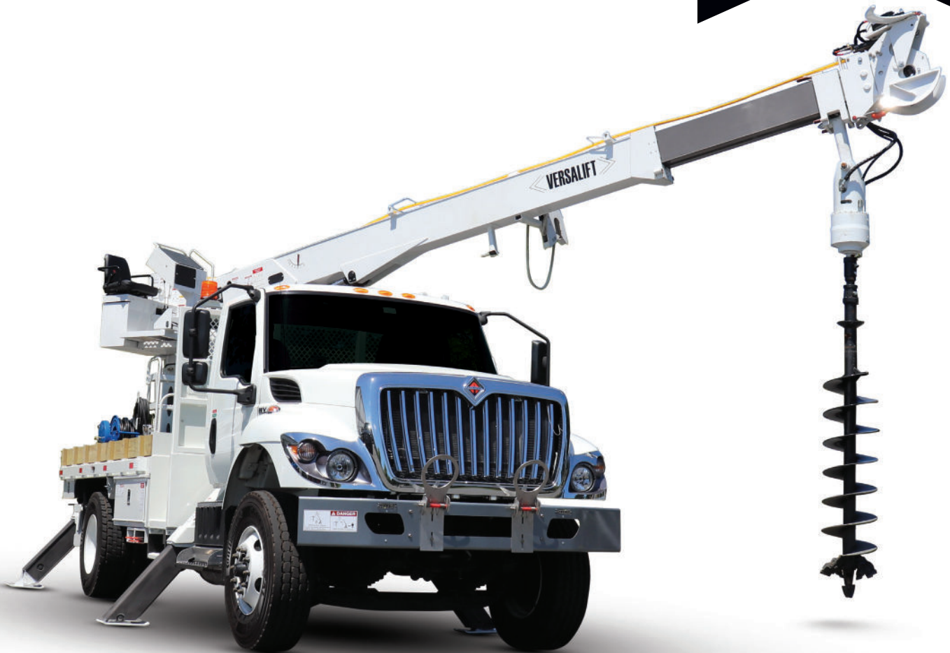
TMD-4050-T model shown here.

GREATEST HORIZONTAL REACH & SHEAVE HEIGHT IN ITS PRODUCT CLASS