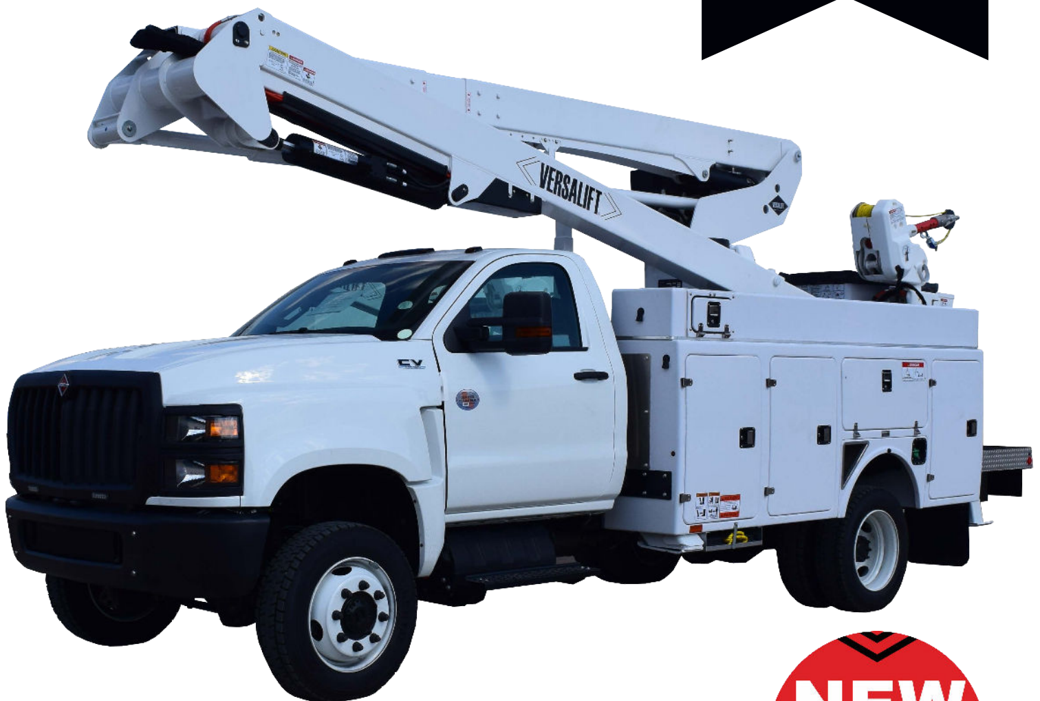
VST-55-HDI shown with Material Handling option.