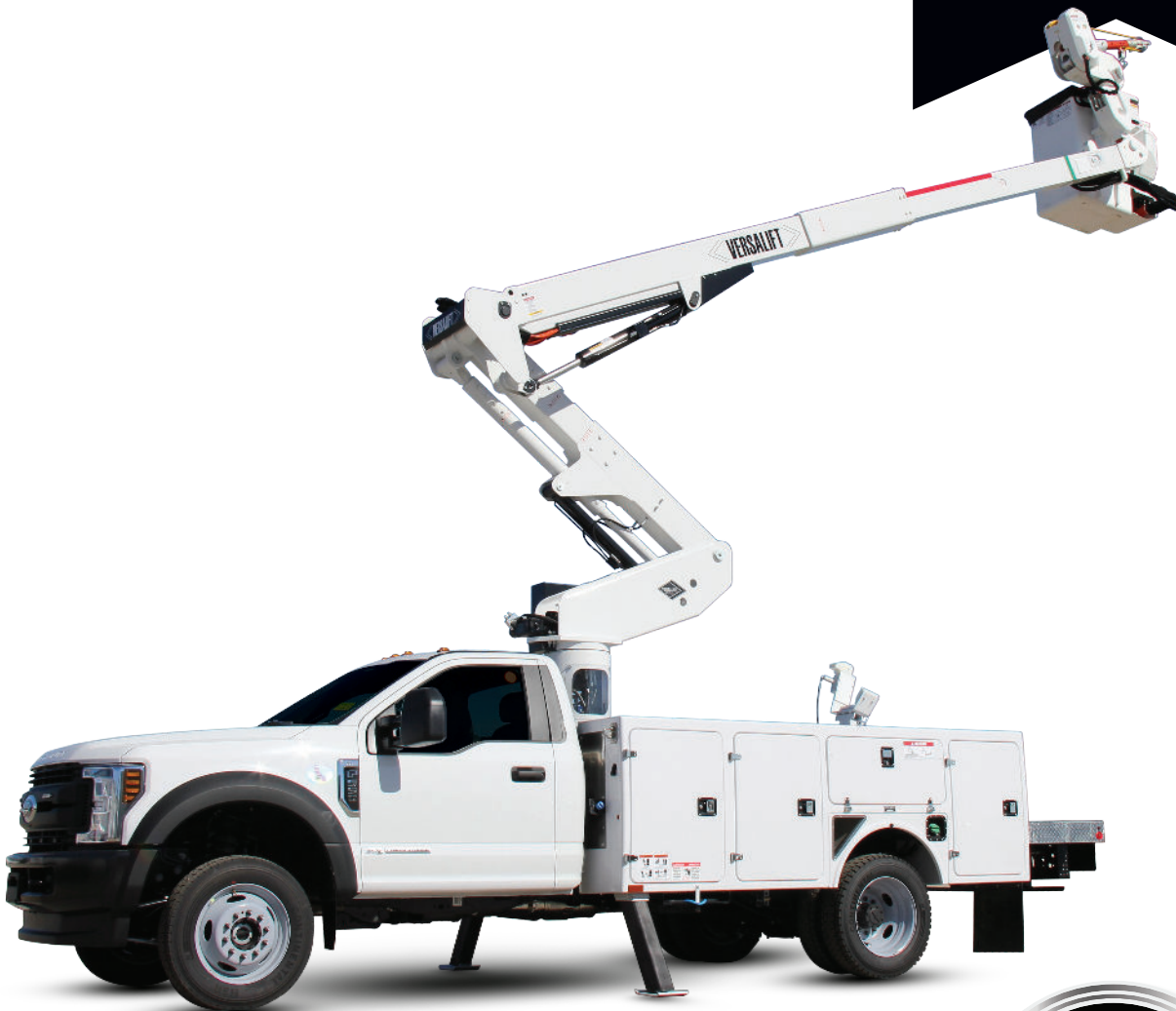
VST-40-I shown with Material Handling option.