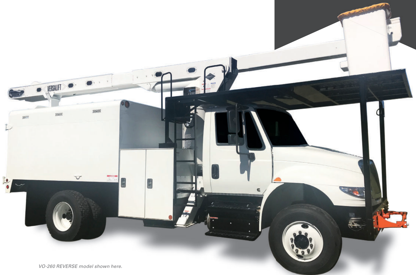
VO-260 REVERSE model shown here.