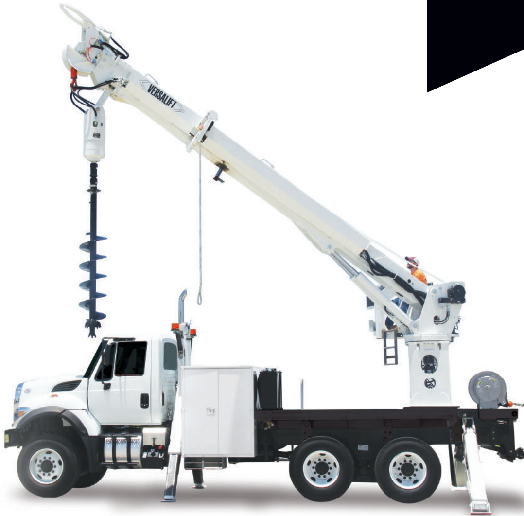
TMD-4060-T model shown here.