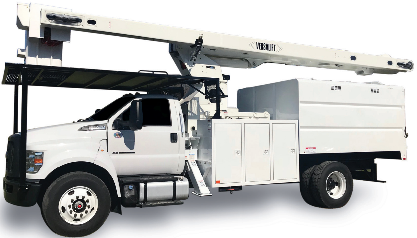
VO-270 REVERSE model shown here.