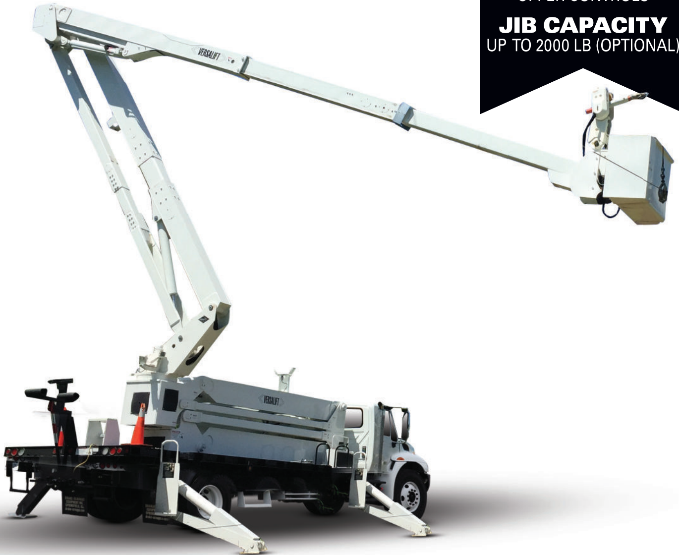
VST-7500-E108 model shown here.

BEST IN CLASS PAYLOAD FULL-PRESSURE HYDRAULIC UPPER CONTROLS JIB CAPACITY UP TO 2000 LB (OPTIONAL)